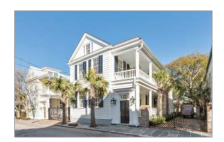
SOUTH OF BROAD 42 Legare Street Sold - 4,340,500