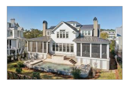
MOUNT PLEASANT 821 Bridgetown Pass Sold - $2,700,000