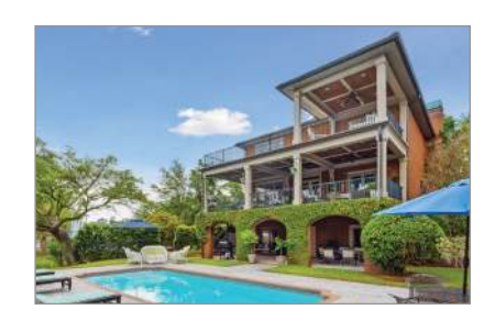
MOUNT PLEASANT 696 Fisherman's Bend Sold - $2,357,500