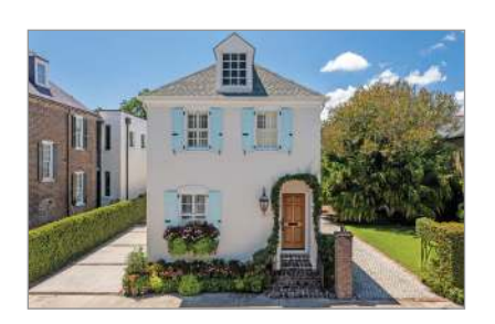
SOUTH OF BROAD 59 King Street Sold - $2,515,000