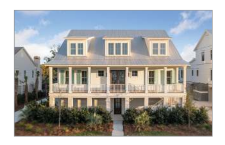
DANIEL ISLAND 767 Dunham Street Sold - $2,870,000