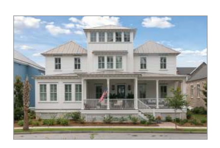
MOUNT PLEASANT 383 Bridgetown Pass Sold - $2,600,000