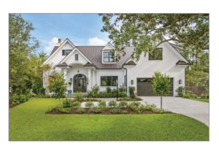
JAMES ISLAND 2040 Coker Avenue Sold - $2,675,000