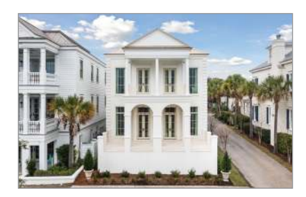
MOUNT PLEASANT 38 Fernandina Street Sold - $3,625,000