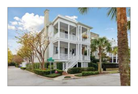
MOUNT PLEASANT 83 Latitude Lane Sold - $2,545,000