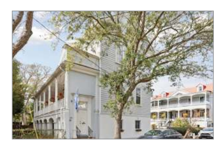
HARLESTON VILLAGE 59 Smith Street Sold -3,250,000