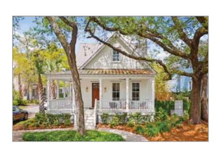
MOUNT PLEASANT 26 Mises Street Sold - $2,295,000