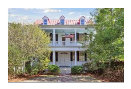
SOUTH OF BROAD 22 Meeting Street Sold - $2,500,000