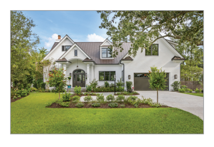
JAMES ISLAND 2040 Coker Avenue Sold - $2,675,000