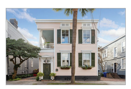
HARLESTON VILLAGE 27 Gadsden Street Sold - $2,000,000