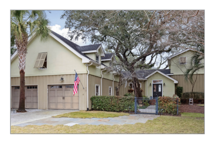
WEST ASHLEY 829 Colony Drive Sold - $1,735,000