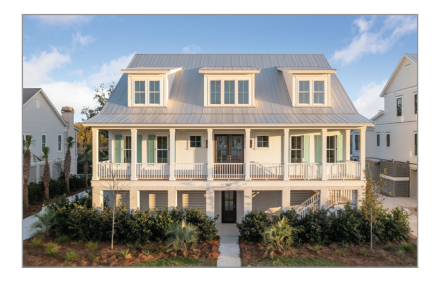
DANIEL ISLAND 767 Dunham Street Sold - $2,870,000