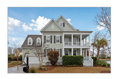
MOUNT PLEASANT 3228 Hatchway Drive Sold - $1,185,000