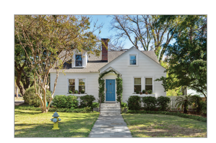
WAGENER TERRACE 10 Clemson Street Sold - $900,000