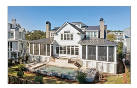
MOUNT PLEASANT 821 Bridgetown Pass Sold - $2,700,000