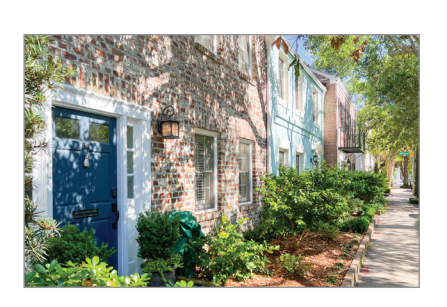
HARLESTON VILLAGE 84 Logan Street Sold - $1,142,500