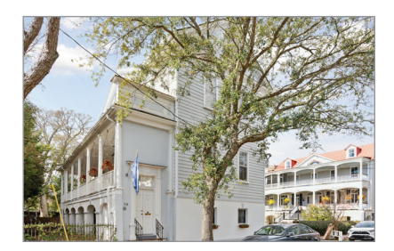
HARLESTON VILLAGE 59 Smith Street Sold -3,250,000