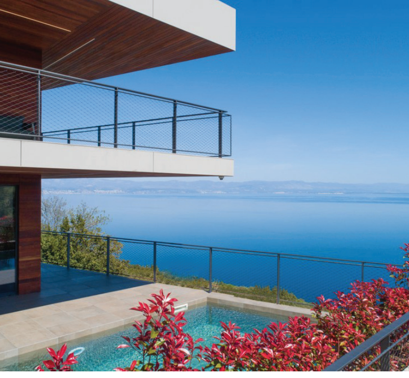
UNIQUE MODERN MANSION OPATIJA RIVIERA

5 BR | 5/1 BA | 356 SQM INT. | 115 SQM TER. MLS 202311605 €4,000,000