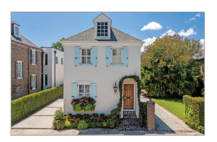
SOUTH OF BROAD 59 King Street Sold - $2,515,000