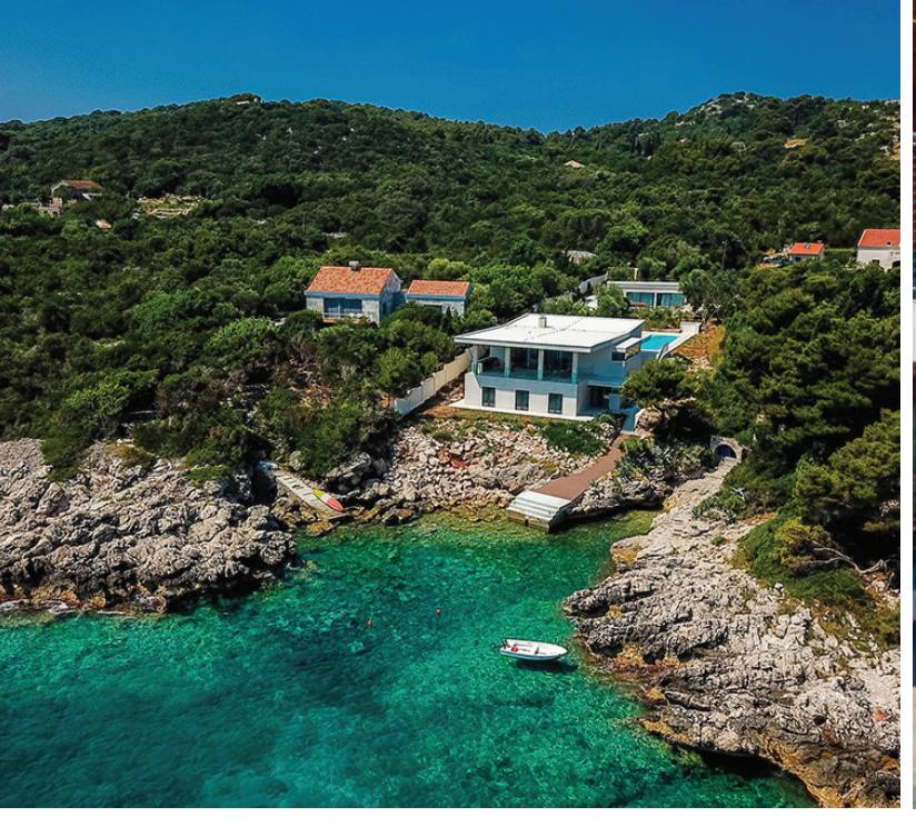
MAGNIFICENT WATERFRONT VILLA DUBROVNIK RIVIERA

5 BR | 5/1 BA | 356 SQM INT. | 115 SQM TER. MLS 202311605 €4,000,000