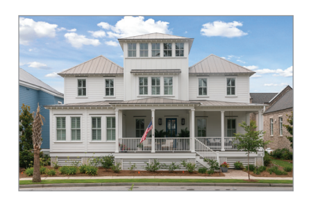
MOUNT PLEASANT 383 Bridgetown Pass Sold - $2,600,000