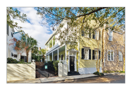
SOUTH OF BROAD 25 Logan Street Sold - $1,850,000