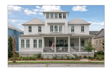
MOUNT PLEASANT 383 Bridgetown Pass Sold - $2,600,000