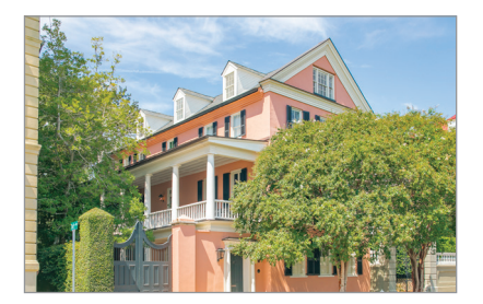
SOUTH OF BROAD 47 East Bay Street Sold - 8,600,000