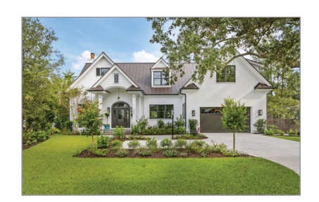
JAMES ISLAND 2040 Coker Avenue Sold - $2,675,000