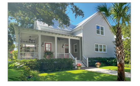
59 Hopetown Road Sold - $2,550,000