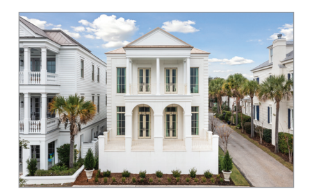
MOUNT PLEASANT 38 Fernandina Street Sold - $3,625,000