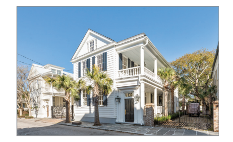
SOUTH OF BROAD 42 Legare Street Sold - 4,340,500