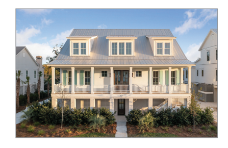
DANIEL ISLAND 767 Dunham Street Sold - $2,870,000