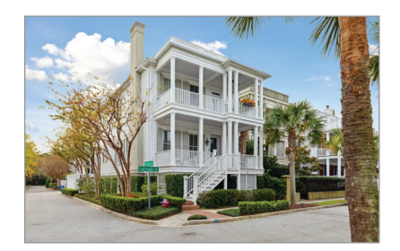
MOUNT PLEASANT 83 Latitude Lane Sold - $2,545,000