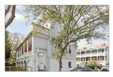
HARLESTON VILLAGE 59 Smith Street Sold -3,250,000