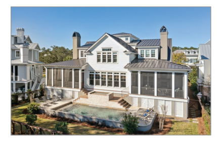
MOUNT PLEASANT 821 Bridgetown Pass Sold - $2,700,000