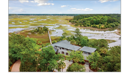
MOUNT PLEASANT 626 Island Walk East Sold -2,950,000