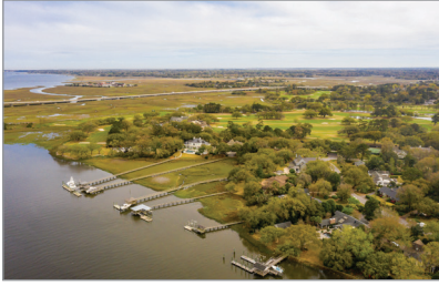
JAMES ISLAND 12 Country Club Drive Sold - $4,250,000