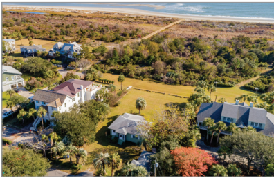
SULLIVAN'S ISLAND 2525 Atlantic Avenue Sold - $3,500,000