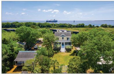
SULLIVAN'S ISLAND 1318 Poe Avenue Sold - $3,350,000