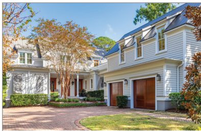
MOUNT PLEASANT 39 Robert Mills Circle Sold - $2,400,000