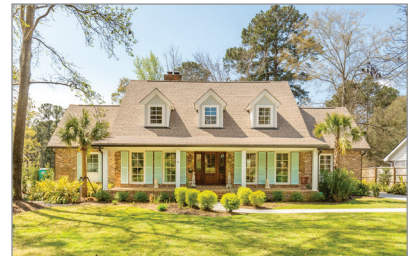
WEST ASHLEY 21 Johnson Road Sold - $2,710,000