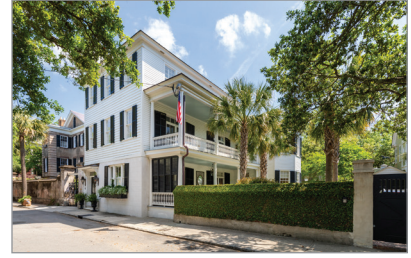
SOUTH OF BROAD 6 Legare Street Sold - $3,550,000