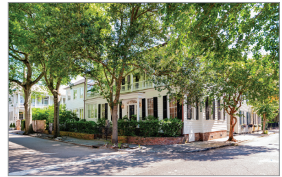
SOUTH OF BROAD 36 Legare Street Sold - $3,200,000