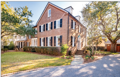
SOUTH OF BROAD 135 South Battery Sold - $3,000,000