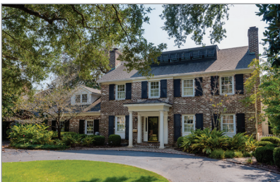
WEST ASHLEY 15 Johnson Road Sold - $2,650,000