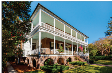
HISTORIC CHARLESTON 64 Vanderhorst Street Sold - $3,000,000