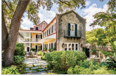
SOUTH OF BROAD 26 Church Street Sold - $3,675,000