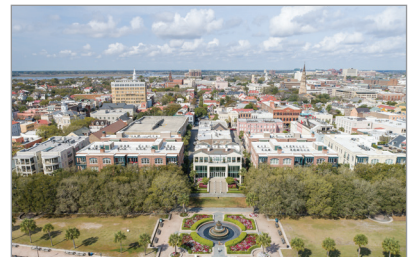
HISTORIC CHARLESTON 36 Prioleau Street unit P Sold - $2,400,000